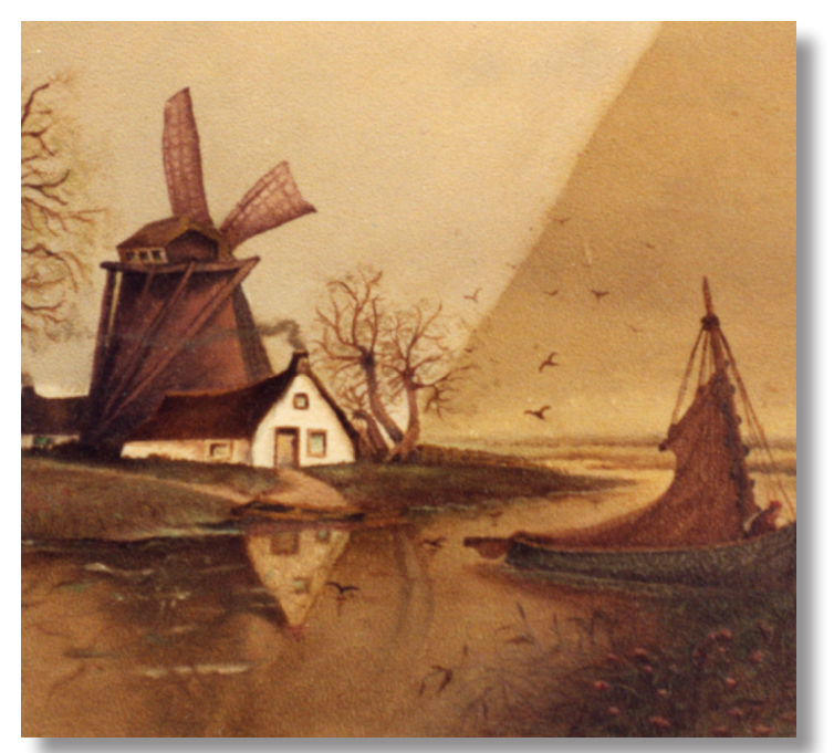
The left side of this painting has been cleaned with Gainsborough Emulsion Cleaner.