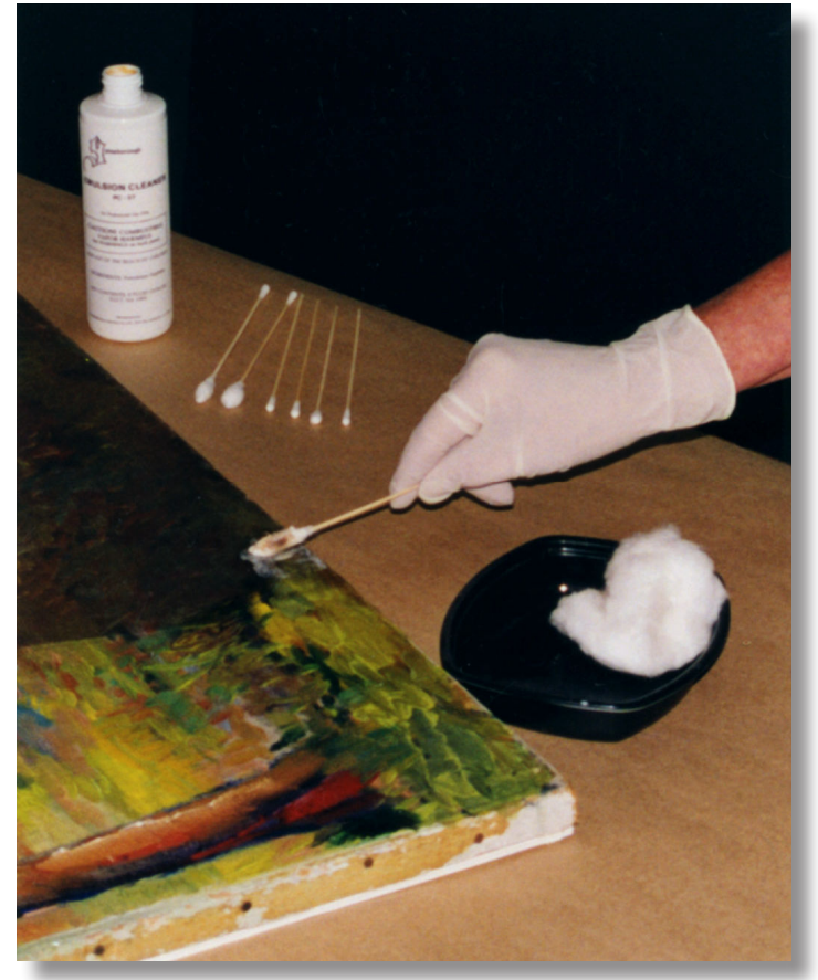
Use a rolling motion, rather than a scrubbing motion, when applying the cleaner.